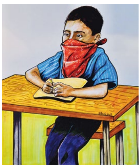
Ledesma's above drawings portray young immigrants going through the trials and tribulations of growing up undocumented in the United States.

Sponsored by ISU's Latin American and Latino/a Studies program